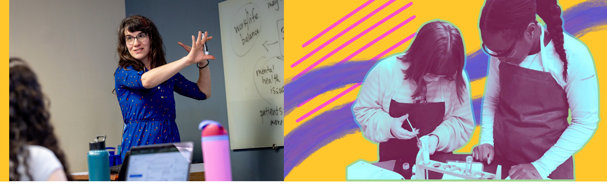
1818 students perform an equilibrium lab in their 1818 Chemistry course at O'Fallon Township High School.