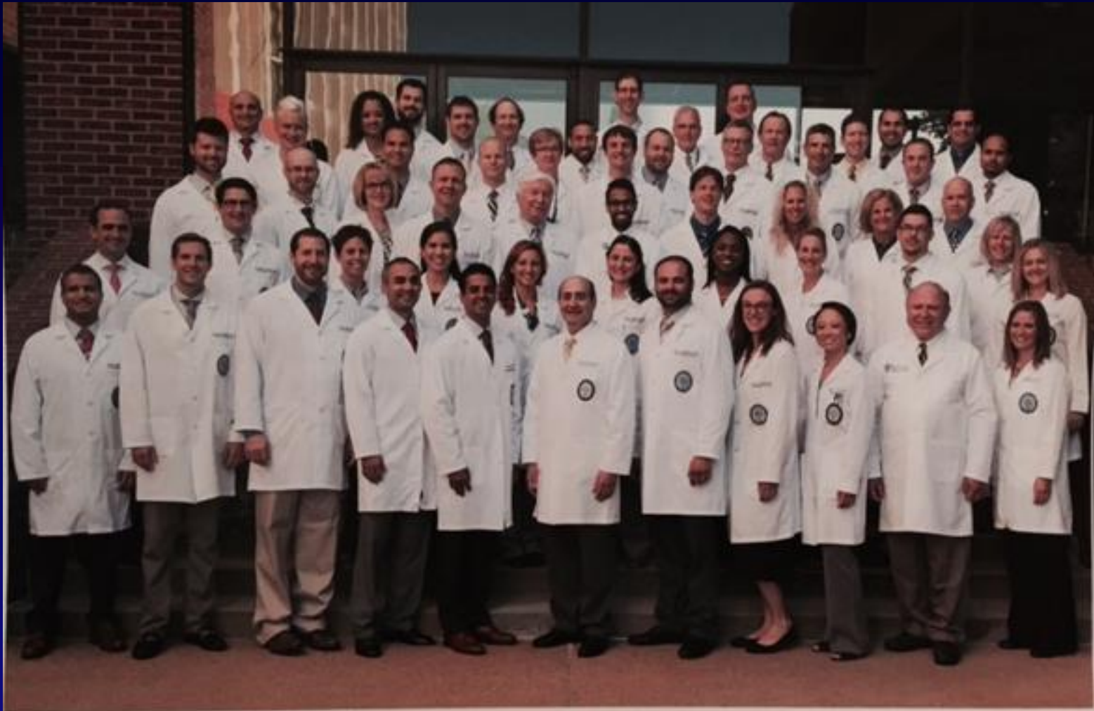
Department of Orthopaedic Surgery Saint Louis University 2014 - 2015